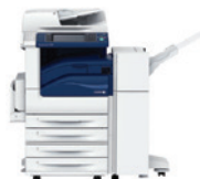
DocuCentre-V 5070 / 4070