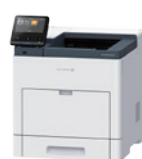
DocuPrint P505 d