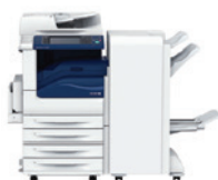
ApeosPort-V 5070 / 4070