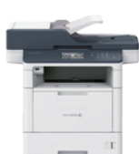
DocuPrint M375 z