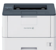
DocuPrint P375 dw