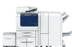
ApeosPort-V 7080 / 6080