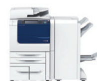
DocuCentre-V 7080 / 6080