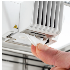
Nozzle covers x10 Keep your print head clean – especially when printing composites