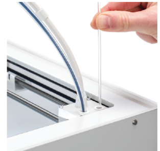
Cleaning filament x10 Ideal for keeping your Ultimaker print cores in optimal condition